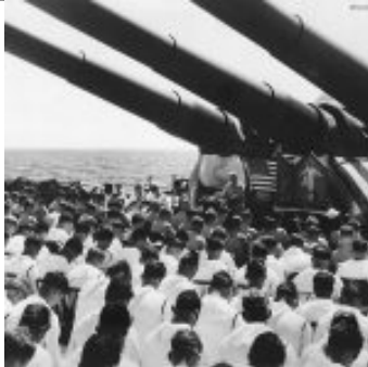
Chaplain Leads Memorial Service on USS South Dakota