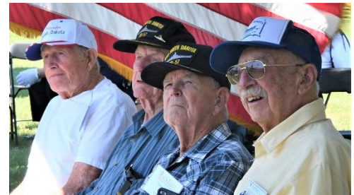
USS South Dakota crew members who attended the 2018 reunion at the ship's Memorial in Sioux Falls, SD. We are so grateful to all of them.