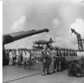
Casualties of USS South Dakota buried at sea off Guam 1944