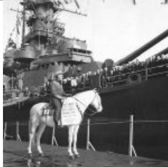
Silver King, brother to Emperor Hirohito's famous white horse Silver Tip, stands on a San Francisco dock looking at Admiral Halsey's battleship, the USS South Dakota