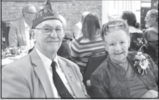
SCENES FROM THE BANQUET