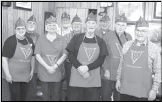
WREATHS ACROSS AMERICA